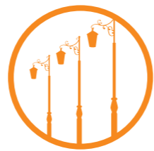
ELEGANT STREET LIGHTING