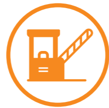
SECURE GATED DEVELOPMENT